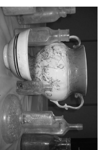
Privies are exciting time capsules containing artifacts from early settlers in Montgomery, such as these household items.

By digging up the privies and unearthing the artifacts buried within them, historians are able to learn about the residents of particular houses; trends through the years and even the ages of people in the house. For instance, on the first day of the privy dig, the crew unearthed a pit that contained vast amounts of beer and whiskey bottles along with a 1917 Red Cross Welcome Home badge from World War I . At the second pit down the street, dated during the same time frame as the first, a large amount of broken china was found with hardly any alcohol bottles. A china doll and marbles were also found, leading to speculation that a girl and boy had inhabited that house.