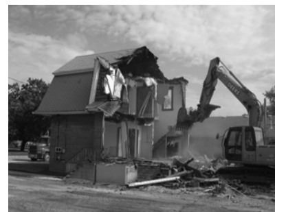
113 N. Main Street

Meanwhile, Village officials and staff continue to work with the architects to finalize the design for the new Village Hall. Schematic design drawings and the project budget will be presented to the Board in June.